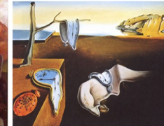
Dali - Persistence of Memory 1931