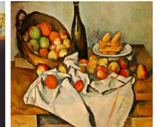
Cezanne - Basket of Apples 1895

Assessment Objectives based on the OCR Art & Design Exam Board. This is what justifies your work into grade 9-1: