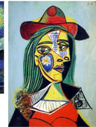
Picasso - Woman in hat and Fur Collar 1937