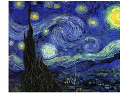
Van Gogh - Starry Night