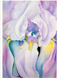
O'Keefe - Light Iris 1924